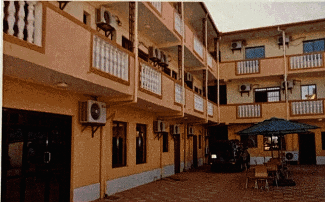
Turn to Page 2 | Juba Crown hotel is one of the complainants